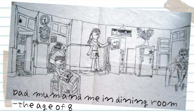
dad, mum and me in dining room -the age of 8

5. I like tokyo very much because of the high convenience and security for its urban life, only if it could rain less... I grew up in china, and have only been to Japan. If one city should be chosen that would be Hangzhou (杭州) of China :). It's a highly developed city, possesses fabulous landscape and pleasant culture atmosphere. Local dishes tastes delicious. Girls are beautiful and boy are smart :).