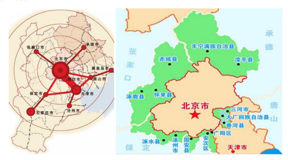
Figure 1: Map of Jing-Jin-Ji Metropolitan

Beijing, the capital city of China, is located at the northern end of the North China Plain, connected to the city of Tianjin, surrounded by Hebei Province. As the second largest city of China, Beijing covers an area of 16,410.54 km², with a resident population of 19.61 million. In the 12th national Five-year Plan (2011-2015), "Capital Economic Circle" is defined for the first time. Although the detailed scope of the circle is still under discussion. Previously, concept of "Jing-Jin-Ji Metropolitan" was frequently used to call the city group of Beijing, Tianjin, and Hebei.