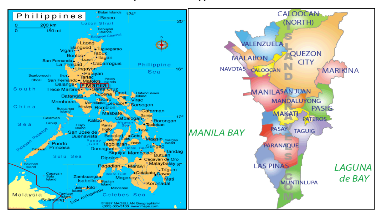
Figure 1: Location of Manila

Metro Manila is the National Capital Region (NCR) of the Philippines with 2007 Census revealed that the population was around 11,547,959 people. With a land area of 636 square kilometres (about 0.2 percent of the total Philippines land area), the population is estimated to reach 13.4 million by the year of 2020. Metro Manila is situated in the lowlands of southwestern Luzon Island and it is composed of 17 cities and municipalities including City of Manila which functions as the capital of the Philippines.