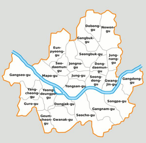
Figure 1: Korea map and location of Seoul