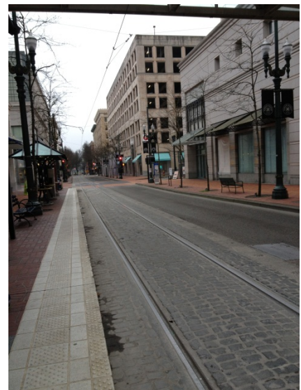
A street view

While visiting the city I noticed that the pace of life is very slow and comfortable, which really matches the urban environment of the city. For example the movement of transportations on the streets was relatively slow as well as the people. As I walked in some of the city areas I think that the cityscape of Portland is very human scale which reflects a very pleasant connection with the pace of life there. Besides the city being green and having many parks and open green spaces, it is also close to the natural beauty and recreational spots such as Mount Hood, Oregon Coast, Running and biking areas..